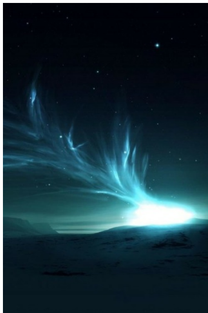
The Aurora Borealis

WE are the light that warms the middle of the week.