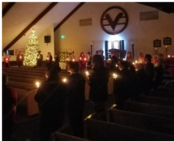
Candlelight Service, Dec. 20, 2017